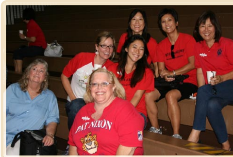
Teachers from Nixon Academy of Multimedia Arts Productions.